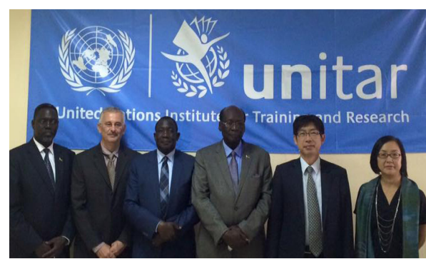
Distinguished quests at the 2015 Fellowship Opening Ceremony

Workshop I, held in Juba, South Sudan, introduces the Fellows to theory and best practice for needs assessment and analysis. Workshop II is held in Tokyo and Hiroshima, Japan, and focuses on the tools and processes for the successful implementation of projects. It also allows the Fellows to learn about the post-conflict reconstruction experiences of the city of Hiroshima, and the tangible and intangible processes that can lead to effective recovery and development. The final workshop in Juba examines skills and techniques for strong leadership and effective communication, with the Fellows presenting their completed proposals to their superiors and stakeholders.